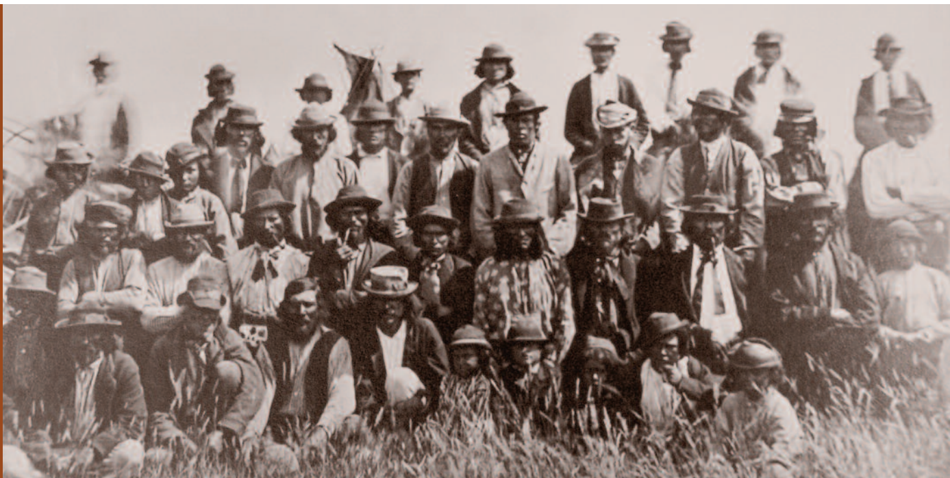
French Métis hunters and traders on the Plain, Boundary Commission, 1872–1874